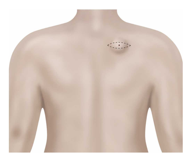
Removing a sebaceous cyst

The stitches may be dissolvable. If not, they are usually left for 5 to 7 days but this will depend on the operation.