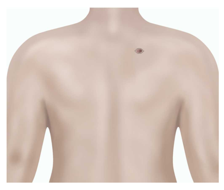
Removing a mole

When removing a mole, your surgeon will cut all the way around it using an elliptical cut. They will close the cut with stitches. The cut usually heals to leave a small straight scar.