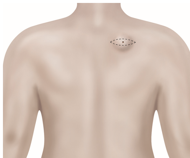
Figure 1 Removing an epidermoid cyst

The stitches may be dissolvable. If not, they are usually left for 5 to 7 days but this will depend on the operation.