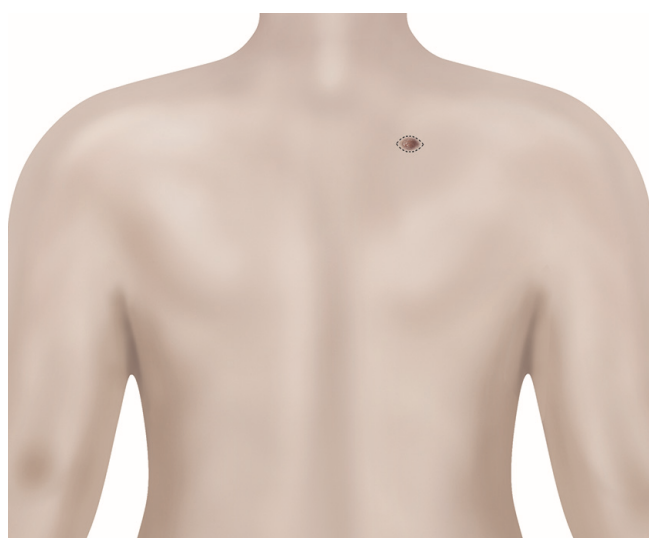
Figure 3 Removing a mole

When removing a mole, your surgeon will cut all the way around it using an elliptical cut (see figure 3). They will close the cut with stitches. The cut usually heals to leave a small straight scar.